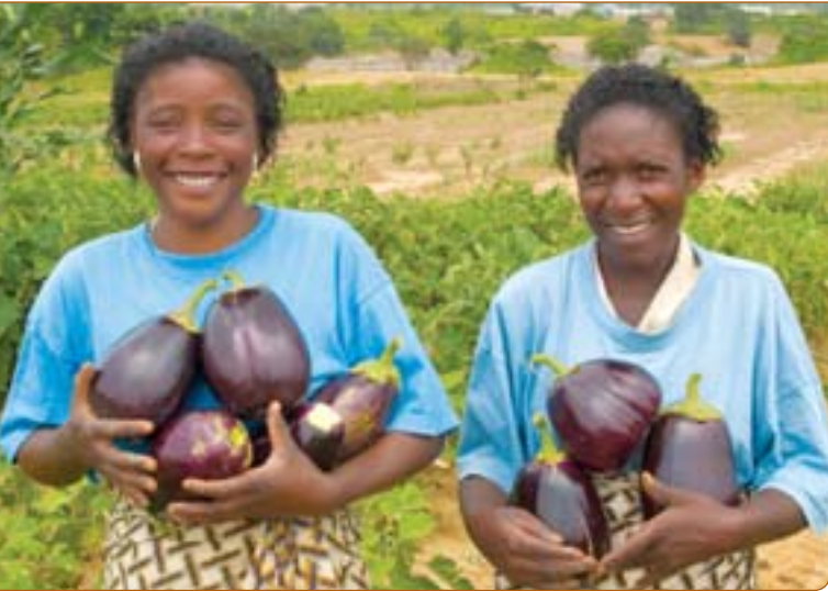
The Kolwezi ladies' market garden