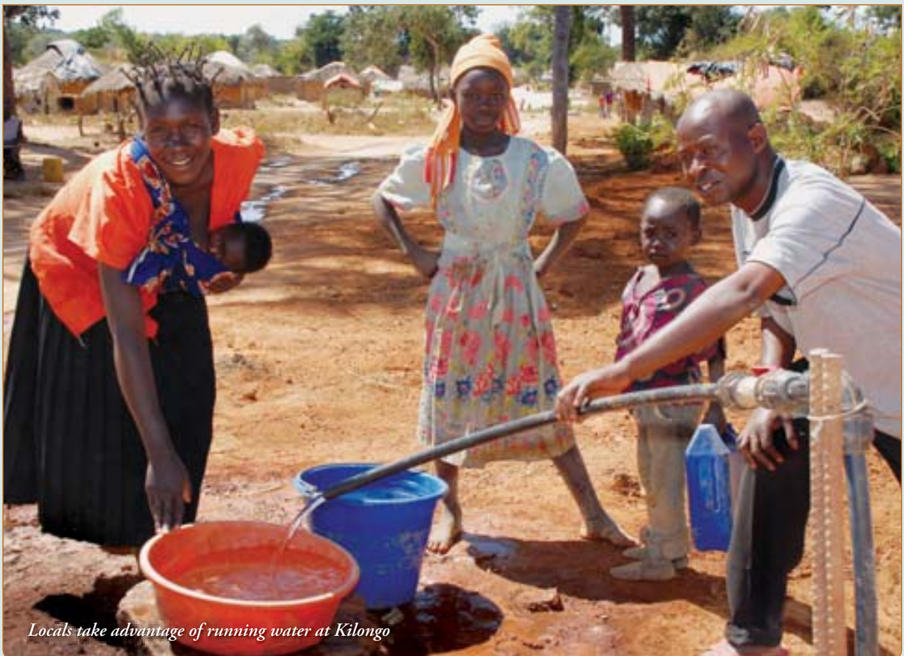
Locals take advantage of running water at Kilongo

Four more boreholes are planned for villages to the north of Kinsevere.