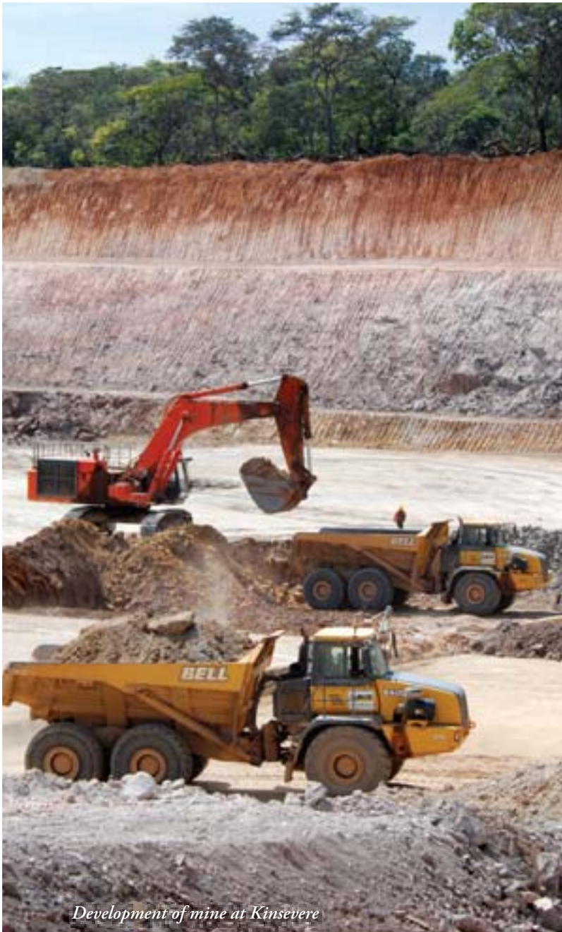
Development of mine at Kinsevere